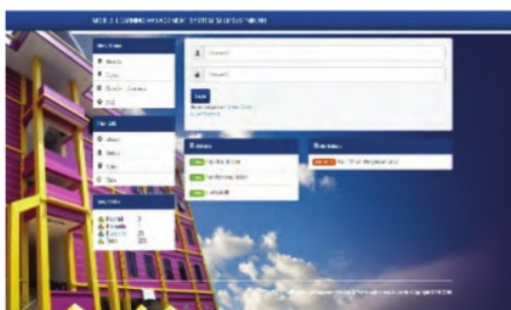
Fig. 2. Registration button.