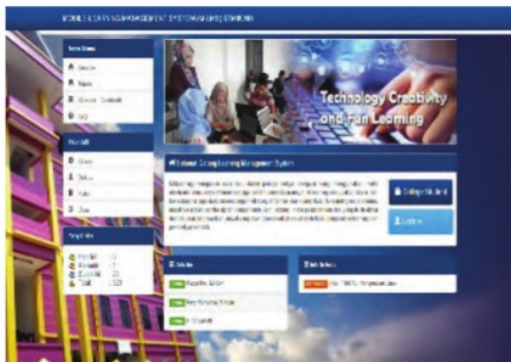
Fig. 1. Lecturer and student's login.

quality and accessibility standards. It is accessible by the students and lecturers of STMIK Nurdin Hamzah with the following prerequisite: